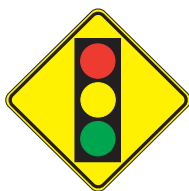
TRAFFIC SIGNAL AHEAD