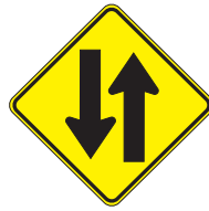
TWO WAY TRAFFIC