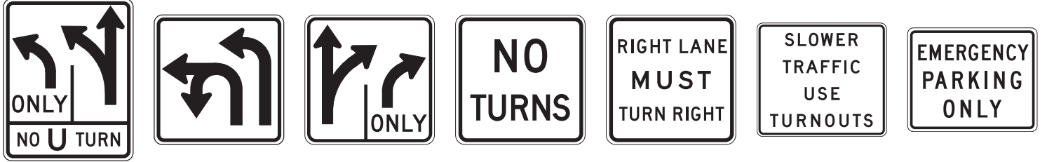
LEFT OR U-TURN