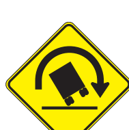
TRUCK ROLLOVER REDUCE SPEED