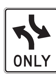
TWO WAY LEFT TURN