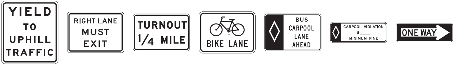
HIGH OCCUPANCY VEHICLE (HOV) FINE