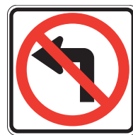
NO LEFT TURN